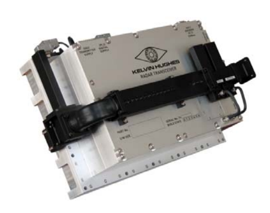
Figure 1 - The solid-state SharpEye series of radars from Kelvin Hughes combine exceptional performance with open-systems interfaces based on ASTERIX standards

After its specification as a standard in 2009, ASTERIX CAT-240 has been adopted by a number of radar manufacturers as their preferred network video standard. For example, the SharpEye series of solid state radars from Kelvin Hughes – see Figure 1- have an option for CAT-240 output. This permits the radar to be used with standard display applications that accept this format, for example a Radar Visualisation Application shown in Figure 2.